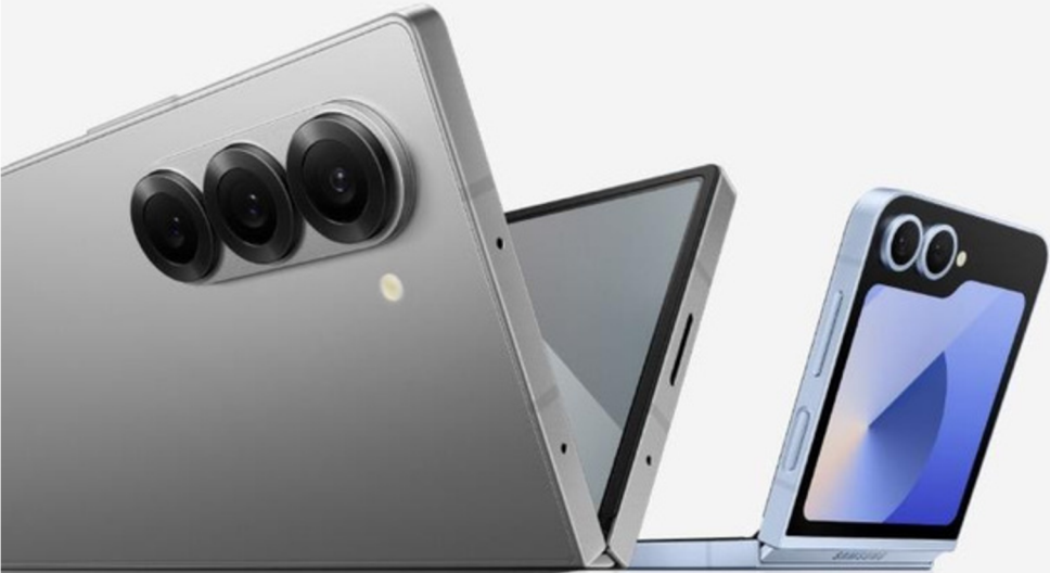
Image simulated. Samsung account login may be required for certain AI features.